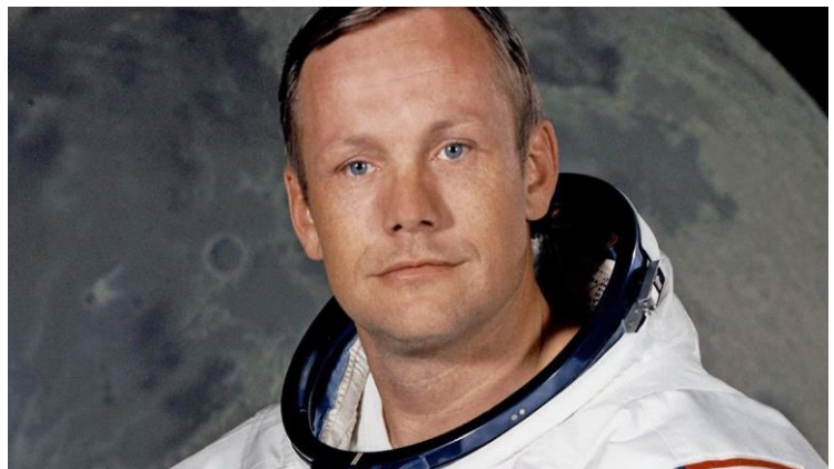
THE FIRST MAN TO WALK ON THE MOON