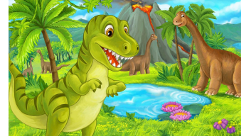
Rhino's Spring Vocabulary Sheet