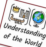
Understanding of the World

We will look at why Christians perform nativity plays at Christmas in our Christianity learning. We will also be looking at the religion: Islam. We will exploring the story: Why did Prophet Muhammad rescue some ants?