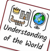
Understanding of the World

Game On will be leading on a Friday - teaching the children how to use all the school PE equipment. We will also be teaching dance.